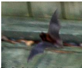
One Sunday Cont'd...

behind-I had my five-month-old son I had to protect him). This bat was huge! I mean I think I saw the ceiling crack