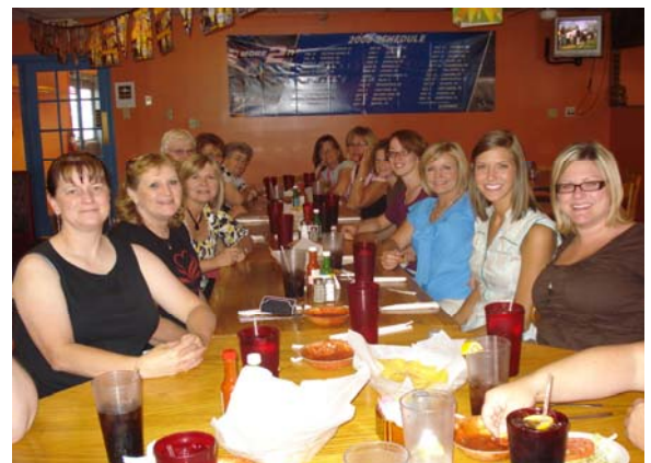
Having lunch at a Mexican restaurant while at the women's retreat.