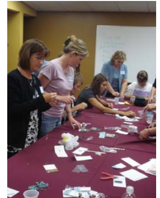
Making key chains was part of the fun at the women's retreat.

Riverside has already purchased tickets for next year! Make plans to join us!