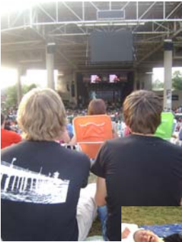
Awesome trip to Indy to see Switchfoot and Third Day! But the highlight was the Gatorade chugging and PB & J's!!