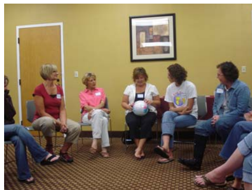
A "getting to know you" activity at the women's retreat.