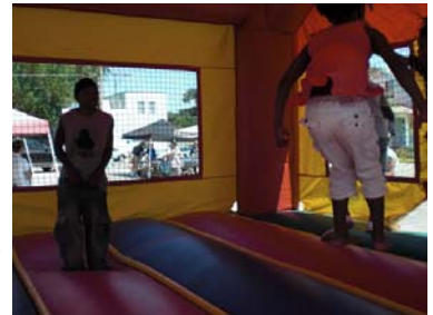
Above: Kids having fun in the Big Bounce.