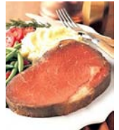
Prime Rib Saturday Night!