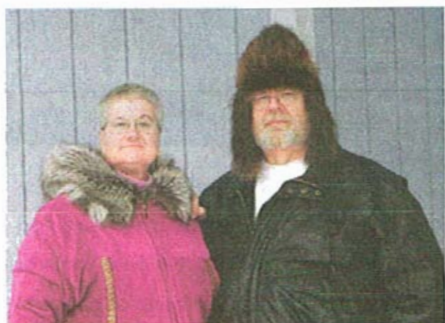
THANK YOU FOR YOUR PRAYERS

We need to give ourselves to the Lord each day and ask the Holy Spirit to guide us in everything we do. This doesn't mean that everything this year is going to be perfect but we can stand on the promises God has given us. He will be our strength. He will give us hope, peace, joy and love as we serve Him