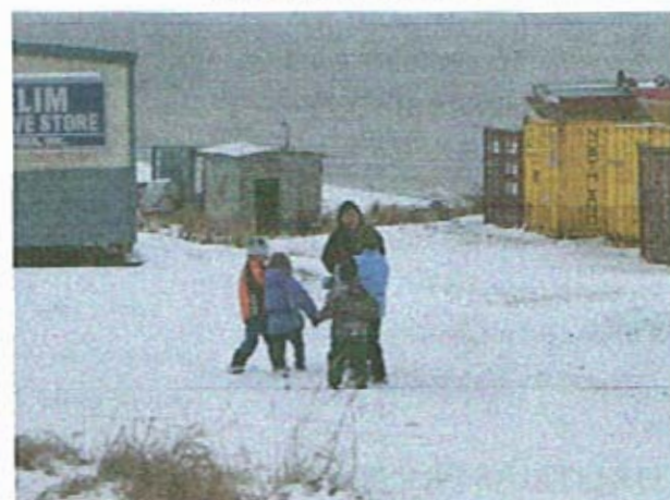
CHILDREN AT PLAY