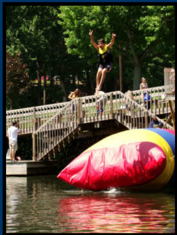
The BLOB is everyone's favorite activity!

To see camp videos, go to the summer camp page at greaterlafayette.younglife.org