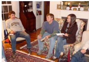
20 Something Small Group

Did you know that Riverside has a range of opportunities for you to benefit from the encouragement and support of others in living the Christian life? These opportunities include Men's and Women's bible studies, the Discovery Hour on Sunday morning, and our small groups. Small