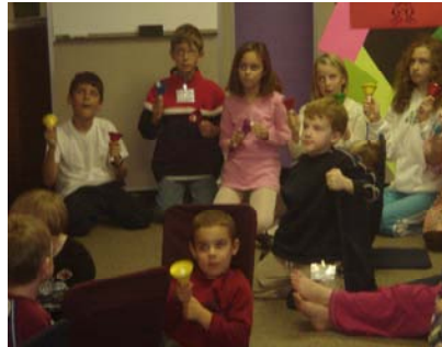
Practicing playing hand bells.

Every character in the Christmas story comes to life in the 3-5 year-old class, from the angels and shepherds to Mary, Joseph, and Baby Jesus. They will be given the opportunity to act out the story and have time for a class celebration. The week following Christ-