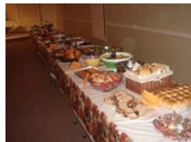
Abundant food...and pie!

"Therefore encourage one another and build each other up, just as in fact you are doing." 1 Thessalonians 5:11