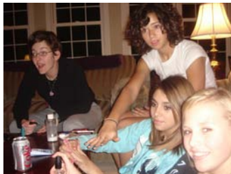
Senior High Girls Slumber Party

I was able to spend some good one-on-one time with the Junior High girls at Prophetstown State Park-we found a half-day and spent it trekking through prairie grass and talking about how awesome God's creation is-it was a gorgeous day to meet Him, especially in such a beautiful setting.