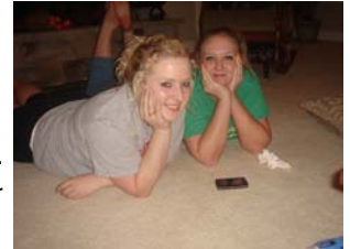
Senior High Girls watching a movie and having fun.

Moving into next month we're launching our daily devotional contest, having lot's of opportunities for fellowship, and taking our faith and steps of service and applying it-DAILY. My hope for the Christmas season is to create an