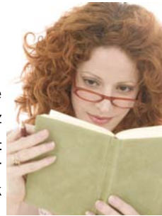
Read a good book. Check out the Riverside Library!