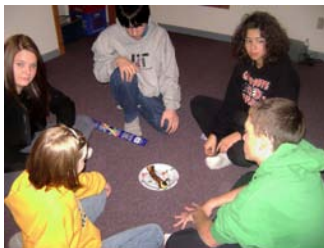
Do what?? With bananas?

What a month January was!! It feels like it has been forever and a day ago that we piled into vans and headed 12 hours (Mapquest promised us it would only be 8.5 hours!) up to Covenant Point for our amazing ski retreat with Battle Ground United Methodist Church as our guests. We took nearly 30 students to UP Michigan for 2 days of fun in the snow and 2 days of lots of driving and bathroom stops!! So...we got a big van stuck in the snow on the way there, we were 3 hours late, and the next morning we were told that skiing was going to be twice as expensive. BUT!!! We got the van out and Ski Brule honored the price that we were originally quoted. After that it was smooth sailing. We had a great day skiing, we went sledding, played broom ball, ate, a lot, did the ice hole dip, and had evening CLUB ANGST. We talked a lot about relationships-with parents, God, friends, significant others-and had follow-up cabin time to get deeper with our cabins. The last night Zach from the Battle Ground church spoke and we had a time where students could verbalize what things in their life hold them back from experiencing God to the fullest. The response