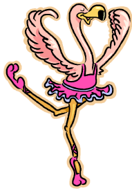
Flamingo Flocking...what's that???

together and enjoyed some pizza while we watched Gospel Journey Maui. Our topic was relationship vs religion and they actually really surprised me when they said they didn't think of religion as a negative word. So maybe it's outgrowing the idea of rituals and traditions that don't necessarily bring us closer in our friendship with the Lord-even so we got to talk about how important it is that we have a relationship, that's a 2-way thing, with Jesus and what that looks like at home and school. That has really been the underlying challenge all year-to make our faith known by how we live our lives out in front of our friends and family.