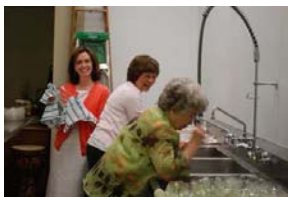
Doing dishes after the women's spring luncheon in Riverside's new kitchen.