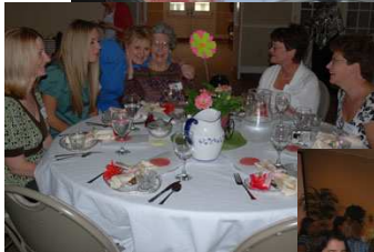
Women's Spring Luncheon 2009