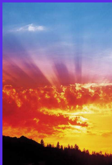
"A Grand New Day"